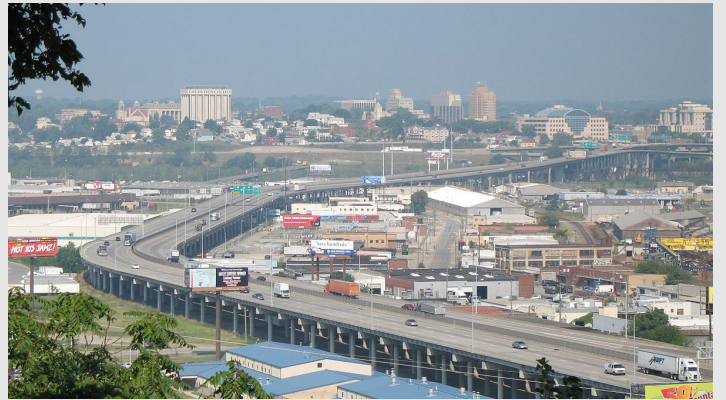
The study prioritized replacing the bridges comprising the Westbound Lewis & Clark Viaduct.

Based on the Lewis & Clark Viaduct study, KDOT is now in the final stages of engineering for the reconstruction of the Westbound Lewis & Clark Viaduct providing a vital link from Kansas City, Missouri to Kansas City, Kansas. The reconstruction project will provide connections to the existing system bridges including I-70 to the west, Minnesota Avenue, Washington Boulevard and Fairfax Trafficway.