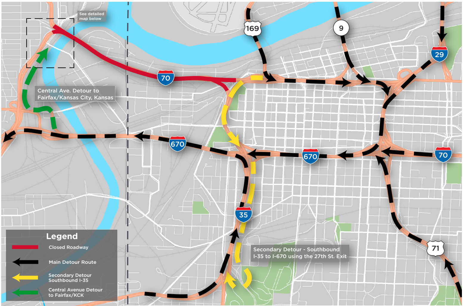
Lewis & Clark Viaduct Detour Map